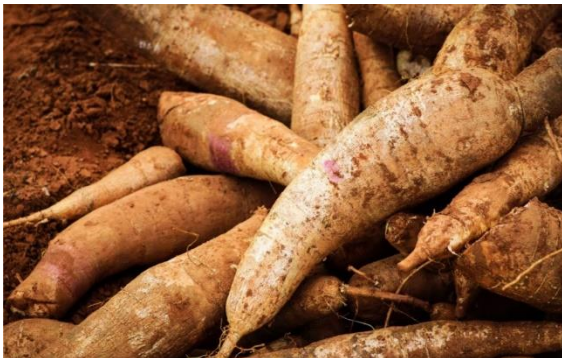
Figure 2 Cassava root

The investigators' attention turned back towards dietary factors. Despite the drought, the problem wasn't a lack of food. While many local people had suffered, few actually starved and unlike later famines elsewhere in East Africa, mortality was low. Much of the credit for this could be attributed to a single plant species that had come to the rescue: Manihot esculenta , also known as 'cassava'. In rural Mozambique, as in much of Africa, people often grow cassava on a small-scale basis close to households as a "crop of last resort," for consumption when they lack other food sources in the hungry season—or in times of conflict, crisis, or drought. Cassava comes in "bitter" and "sweet" (or, more accurately, "not bitter") varieties, with the bitter types particularly valued for their resistance to locusts and other herbivores.