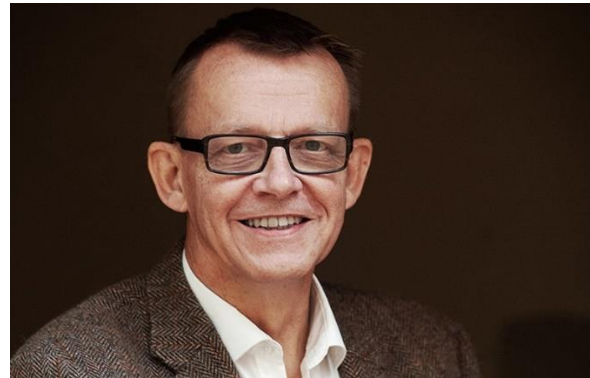
Figure 3 Hans Rosling 27 7 1948 – 7 2 2017