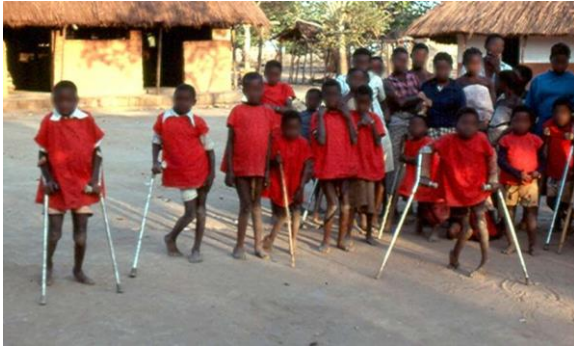
Figure 1 Stricken individuals, 1981 (via Global Health NOW)

The investigators' attention turned back towards dietary factors. Despite the drought, the problem wasn't a lack of food. While many local people had suffered, few actually starved and unlike later famines elsewhere in East Africa, mortality was low. Much of the credit for this could be attributed to a single plant species that had come to the rescue: Manihot esculenta , also known as 'cassava'. In rural Mozambique, as in much of Africa, people often grow cassava on a small-scale basis close to households as a "crop of last resort," for consumption when they lack other food sources in the hungry season—or in times of conflict, crisis, or drought. Cassava comes in "bitter" and "sweet" (or, more accurately, "not bitter") varieties, with the bitter types particularly valued for their resistance to locusts and other herbivores.